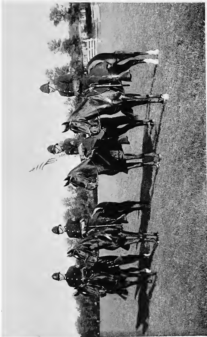
FOUR NON-COMMISSIONED OFFICERS